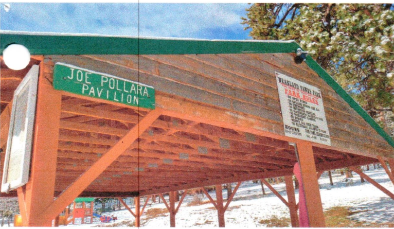
Repair work at north side of pavilion, sign, base brackets and swing by Bruce Stoeber